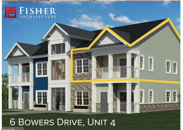
6 BOWERS DRIVE, UNIT 4